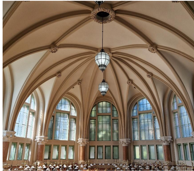
Library of the Budapest University of Technology and Economics